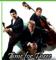
Time for Three