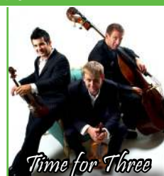
Time for Three