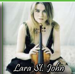
Lara St. John